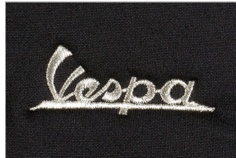
Silver Metallic - Specialty Thread