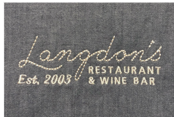
Standard Embroidery - Bean Stitch