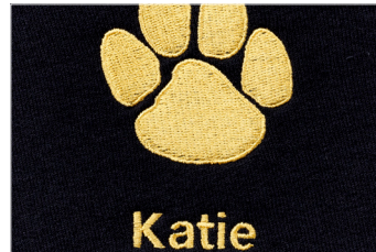
Standard Embroidery - Monogram

As the leader in embroidery, Vantage is always on top of the latest trends in specialty threads, appliqués and stitch techniques. Whether you have one piece or 100,000 pieces, Vantage can turn your order fast!