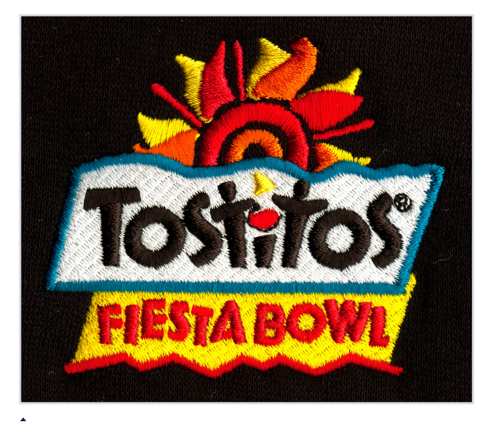
16,912 STITCHES : Padded logo with unnecessary stitches that cost you more.