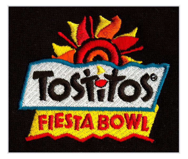
12,721 STITCHES: Vantage optimizes stitch usage for best appearance and production efficiency.

Because we digitize our logos and embroider our products under the same roof, you can be assured your logos will be digitized most efficiently to run on our embroidery machines. That means you do not have to worry about logos being "padded" with extra stitches. Thanks to our decades of experience, you can also avoid poor stitch coverage that saves machine run time but harms the look of your logo.