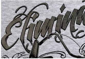
Metallic Black Onyx

Vantage offers several specialty inks, including clear soft-hand for tonal looks as well as metallic silver, metallic gold and metallic black onyx for more impact. The metallic appearance of metallic silver, metallic gold and metallic black onyx inks may fade with machine washing & drying. For best results, hand-wash and line dry. Additional specialty inks may be available for larger orders.