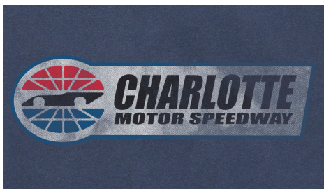
Spot Color with Distressed Art