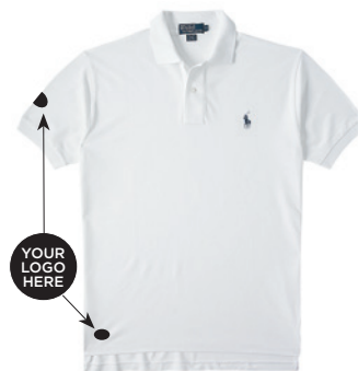
C A custom-colored Polo pony embroidered left chest with the customer logo embroidered at either right sleeve or bottom right hem.