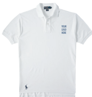
B Placement of customer logo at left chest with a custom-colored Polo pony on the bottom right hem.