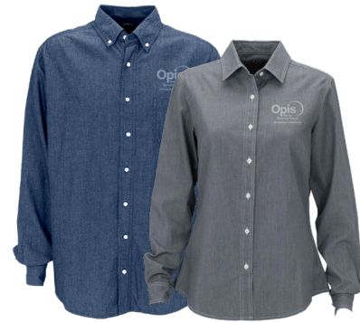
1977 M | 1978 W HUDSON DENIM SHIRT - 2 COLORS Perfect for everyday wear in any climate, our lightweight Hudson denim shirt has a worn-in feel, modern look and sleek fit.