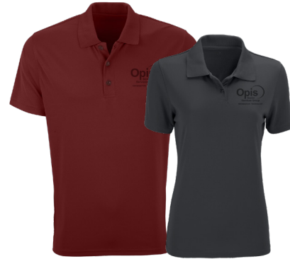
2600 M | 2601 W OMEGA POLO - 21 COLORS Our best-selling, moisture-wicking golf shirt is specially engineered to resist snags and pulls, with a softer hand.