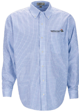
1105 EASY-CARE POPLIN BOX PLAID SHIRT - 3 COLORS The patterned button-down shirt designed to please the more conservative dresser, offering a timeless look that always feels fresh and stylish.