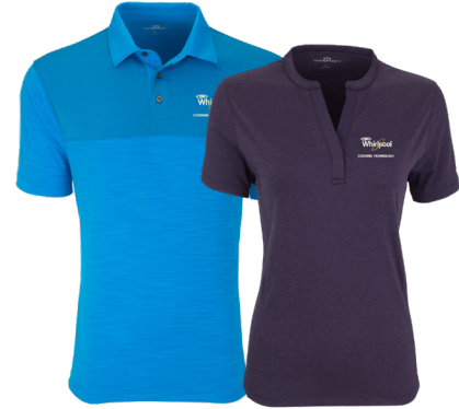
2475 M | 2476 W VANSPOUR PRO HORIZON POLO - 4 COLORS A mix of tonal textures adds visual interest to this sporty performance polo. Heather jersey, moisture wicking and UV properties.