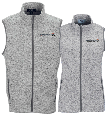
3307 M | 3308 W SUMMIT SWEATER VEST - 1 COLOR This essential layering piece combines the style of a heathered sweater with the comfort of your favorite fleece.