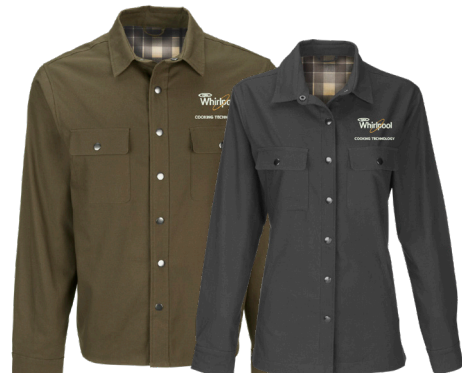
7340 M | 7341 W BOULDER SHIRT JACKET - 3 COLORS Rugged and modern styling add to the versatility of this flannel-lined, workwear-inspired shirt jacket. Snap-front closure & cuffs, shirt-tail hem.