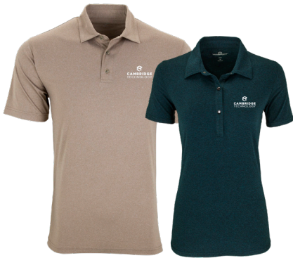
8060 M | 8061 W VANSPOUR PLANET POLO - 4 COLORS Made with comfortable, high-quality Repreve recycled polyester, keeping plastic bottles from landfills and oceans. Heather jersey, moisture wicking.