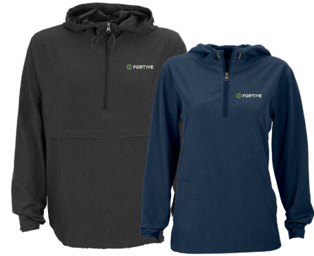
6105 M | 6106 W PULLOVER STRETCH ANORAK - 2 COLORS A lightweight, pliant, and protective Anorak that's perfect for transitional weather and outdoor events.