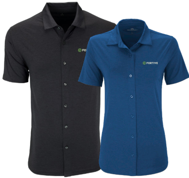
1885 M | 1886 W VANSPOUR PRO VENTURA POLO - 4 COLORS Modern camp-style polo combines polished performance with a casual vibe. Mélange jersey with UV and antimicrobial properties.