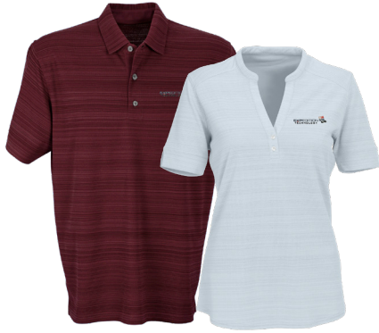
2795 M | 2796 W VANSPOUR STRATA TEXTURED POLO - 6 COLORS This performance polo has its unique pattern from a double-knit variegated texture on the outside while the inside has a smooth hand for comfort.