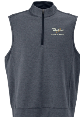
5760 CYPRESS VEST - 3 COLORS An easy addition to a favorite polo or button-down shirt, the Cypress Vest is a luxurious layer with technical benefits and a natural look and feel.