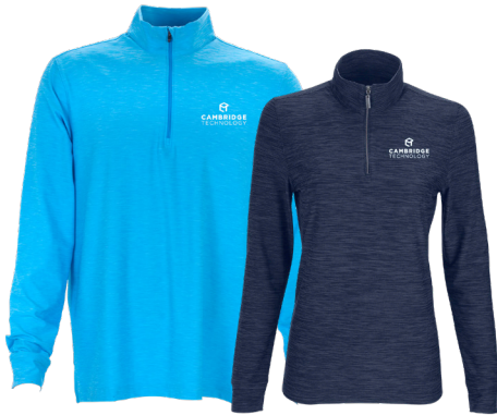
GNS7K020 M | WNS9K060 W GREG NORMAN 1/4 ZIP - 3 COLORS Smooth heathered jersey pullover is soft to the touch with plenty of stretch for active play.