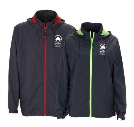
7162 M | 7163 W CLUB JACKET - 6 COLORS

Contrasting elements give the Club wind jacket an urban edge. 100% polyester, micro-poplin, water-repellent finish, Zocket™ that folds into self-pouch.