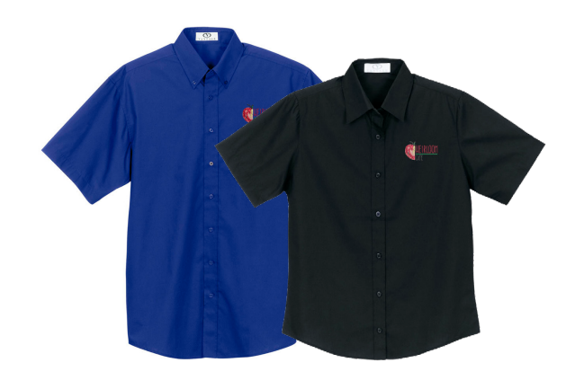
1100S M | 1101S W BLENDED POPLIN SHORT SLEEVE SHIRT - 4 COLORS When rolling up the sleeves just won't do, try the short-sleeve version of our Women's Blended Poplin Shirt.