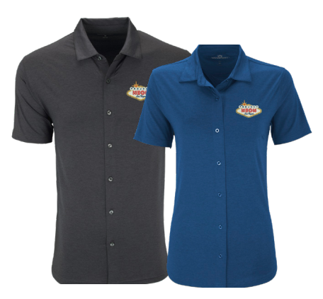
1885 M | 1886 W VANSPORT PRO VENTURA POLO - 4 COLORS Modern-day, camp-style polo combines polished performance with a casual vibe, with UV and antimicrobial properties, tagless label for comfort.