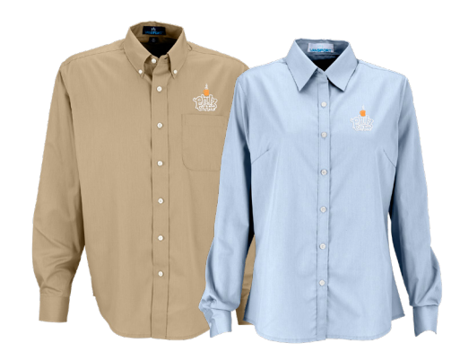
1205 M | 1206 W VANSPORT WICKED WOVEN® - 7 COLORS An upgraded dress shirt designed with breathable, moisture-wicking fabric to keep you cool and comfortable all day. Wrinkle resistant & UV protection.