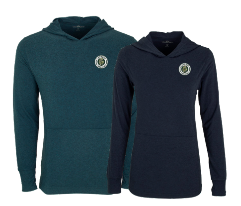
8062 M | 8063 W VANSPORT TREK HOODIE - 4 COLORS

Contrasting elements give the Club wind jacket an urban edge. 100% polyester, micro-poplin, water-repellent finish, Zocket™ that folds into self-pouch.