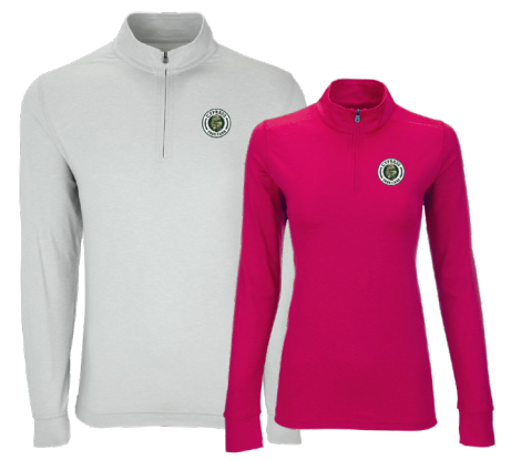
3450 M | 3451 W VANSPORT ZEN PULLOVER - 11 COLORS The perfect balance is easy to obtain with a smartly fashioned sport pullover that pleases the mind and the body.