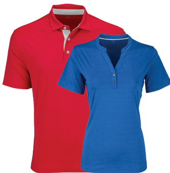
VANSPOUR PRO SIGNATURE & BOCA POLO 2460 M / S-5XL / 6 Colors 2471 W / XS-3XL / 4 Colors