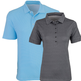
VANSPOUR PRO EAGLE POLO 2480 M / S-5XL / 4 Colors 2481 W / XS-3XL / 4 Colors