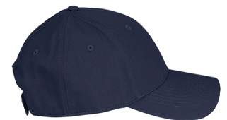
CLUTCH SOLID CONSTRUCTED TWILL CAP

7360 M / S-5XL / 1 Color 7361 W / XS-3XL / 1 Color