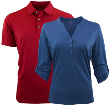
VANSPORT VICTORY POLO 2945 M / S-5XL / 5 Colors 2946 W / XS-3XL / 5 Colors