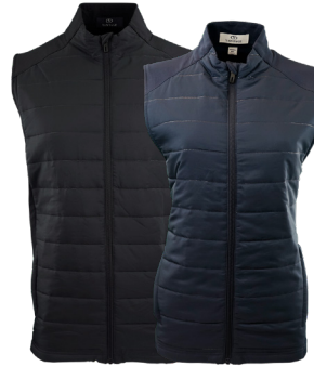
NINJA VEST 7387 / S-5XL / 2 Colors 7388 / XS-3XL / 2 Colors