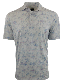
GREG NORMAN CROSSHATCH PALM ML75 STRETCH POLO GNS4K534 M / S-3XL / 1 Color