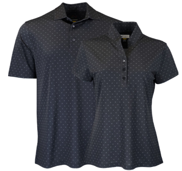
GREG NORMAN FREEDOM MICRO PIQUE SPINNER PRINT POLO GNF2K487 M / S-3XL / 1 Color WNF2K488 W / S-3XL / 1 Color