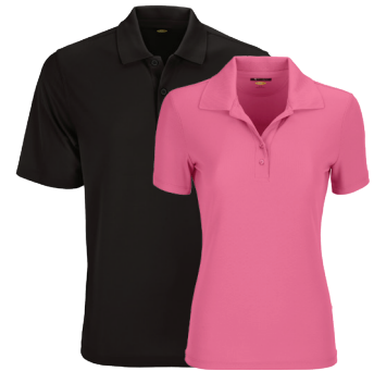
GREG NORMAN PLAY DRY® MESH POLO GNS3K440 M / S-3XL* / 14 Colors WNS3K445 W / S-2XL / 15 Colors * more sizes online