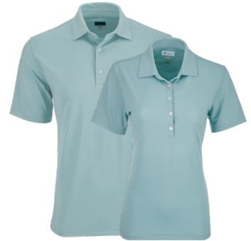
GREG NORMAN FREEDOM POLO GNS2K480 M / S-3XL / 6 Colors WNS2K450 W / S-2XL / 6 Colors