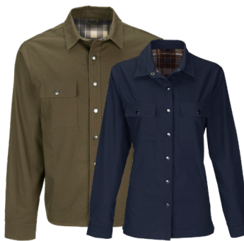
BOULDER SHIRT JACKET

3305 M / S-5XL / 3 Colors 3306 W / XS-3XL / 3 Colors