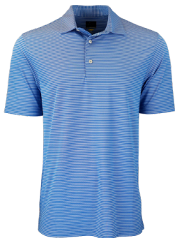
GREG NORMAN FREEDOM MICRO PIQUE STRIPE GNS3K485 M / S-3XL / 3 Colors