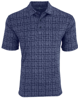
VANSPOUR PRO CLUBHOUSE POLO 2485 M / S-5XL / 2 Colors