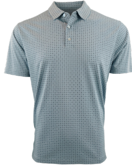
ARROWHEAD POLO 2995 M / S-5XL / 2 Colors