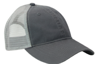
CLUTCH BIO-WASH TRUCKER CAP

GNS8J049 M / S-3XL / 2 Colors WNS8J050 W / S-3XL / 2 Colors