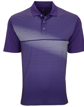
VANSPOUR PRO HIGHLINE POLO 2455 M / S-3XL / 5 Colors