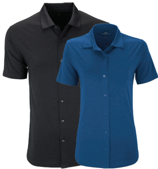
VANSPOUR PRO VENTURA POLO 1885 M / S-5XL / 4 Colors 1886 W / XS-3XL / 4 Colors