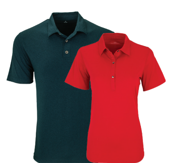
VANSPOUR PLANET POLO 8060 M / S-5XL / 8 Colors 8061 W / XS-3XL / 8 Colors