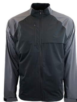
GREG NORMAN WEATHERKNIT FULL ZIP JACKET GNS4J055 / S-3XL / 1 Color