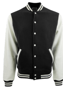
VARSITY JACKET 7077 M / XS-5XL / 2 Colors