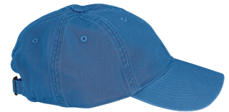
CLUTCH BIO-WASHED UNCONSTRUCTED TWILL CAP

3275 M / S-5XL / 5 Colors 3271 W / XS-3XL / 8 Colors