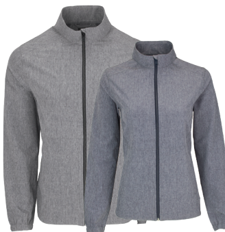
GREG NORMAN STRETCH WINDBREAKER

GNS0V055 M / S-3XL / 1 Color WNS0J360 W / S-3XL / 1 Color