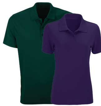
VANSPOUR OMEGA SOLID MESH TECH POLO 2600 M / S-5XL* / 21 Colors 2601 W / XS-3XL / 21 Colors * more sizes online