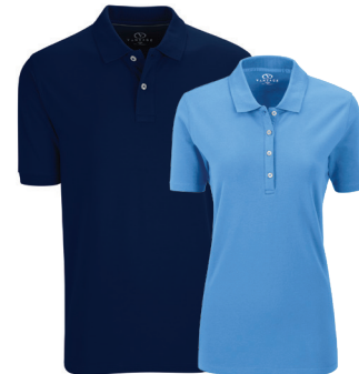
PERFECT POLO® 2300 M / S-5XL / 11 Colors 2301 W / XS-3XL / 12 Colors