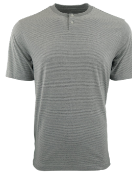
HARLOW HENLEY 2325 M / / 1 Color