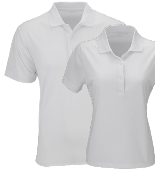
VANSPOUR MARCO POLO 2000 M / S-5XL* / 6 Colors 2001 W / XS-3XL / 6 Colors * more sizes online