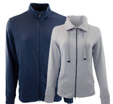
GREG NORMAN FULL ZIP JACKET GNF2K750 M / S-3XL / 3 Colors WNS4J471 / S-3XL / 3 Colors