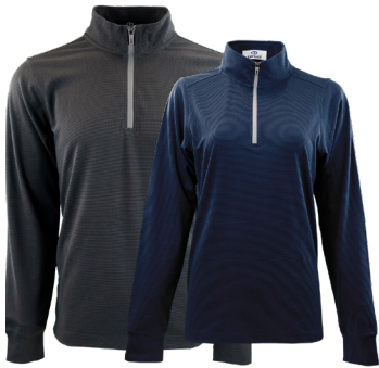
GRID PULLOVER 3440 M / S-5XL / 3 Colors 3441 W / XS-3XL / 3 Colors