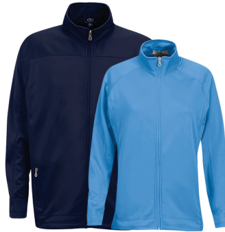
BRUSHED BACK MICRO-FLEECE FULL-ZIP JACKET

7162 M / S-3XL* / 6 Colors 7163 W / XS-3XL / 6 Colors * more sizes online