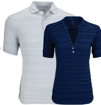
VANSPOUR STRATA TEXTURED POLO 2795 M / S-5XL / 6 Colors 2796 W / XS-3XL / 6 Colors