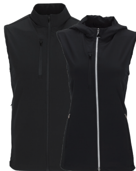
GREG NORMAN WINDBREAKER FULL-ZIP VEST

7385 M / S-5XL / 2 Colors 7386 W / XS-3XL / 2 Colors