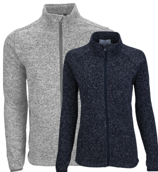
SUMMIT SWEATER-FLEECE JACKET

3305 M / S-5XL / 3 Colors 3306 W / XS-3XL / 3 Colors